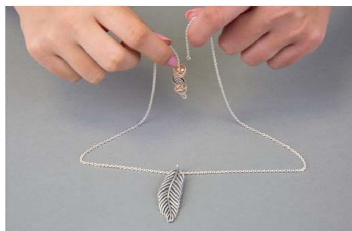
7 Holding the two ends, drop the chain that you started threading with through each bead