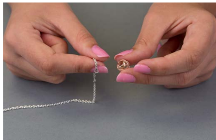
2 Start by threading the first charm onto the end of the chain that doesn't have the clasp. Please note that this first charm will be at the very top of your stack if you continue to add more.