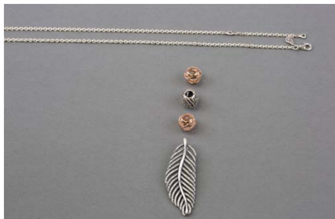
1 First, choose the charms and pendant you would like to wear on your PANDORA chain.