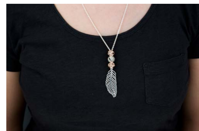
You are now ready to wear your new PANDORA necklace creation