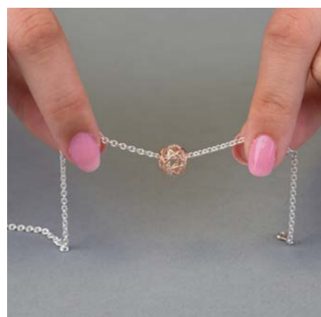
3 Pull the bead along the chain until it is at the end near the clasp