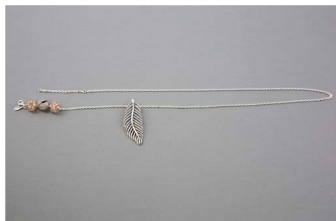
6 Next, add your pendant, but make sure you do not tread it all the way to the end