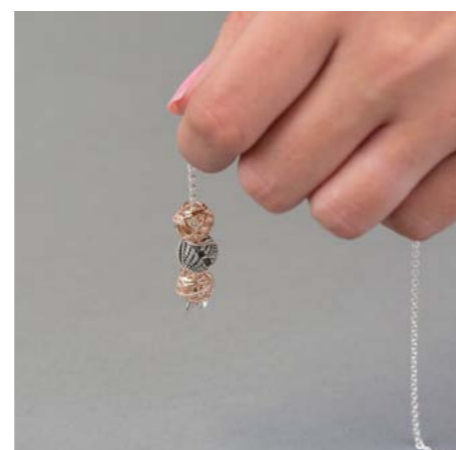
5 At this stage, add any other charms that you like to rest on top of your pendant