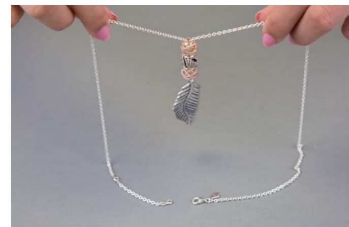
9 The beads will now drop into place on top of the pendant