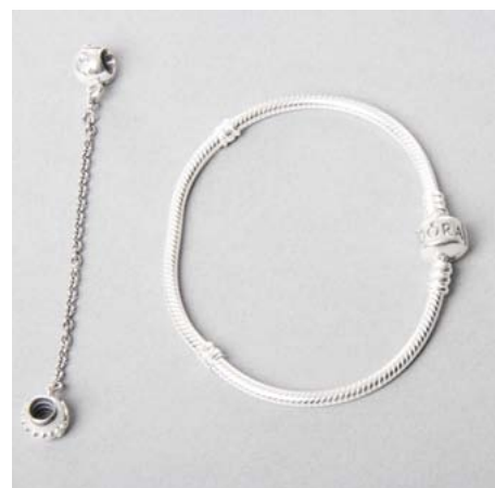
The tools you will need.

“PANDORA safety chains work as a great support mechanism to keep all of your charms on your bracelet, and your bracelet on your wrist. But how do you attach them correctly?”